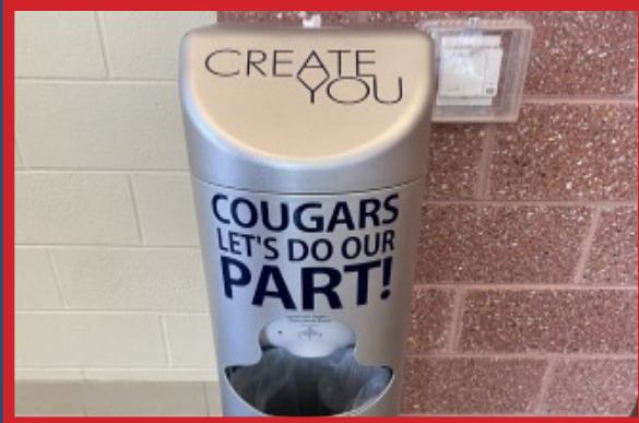
Sanitizing Stations with Wipes