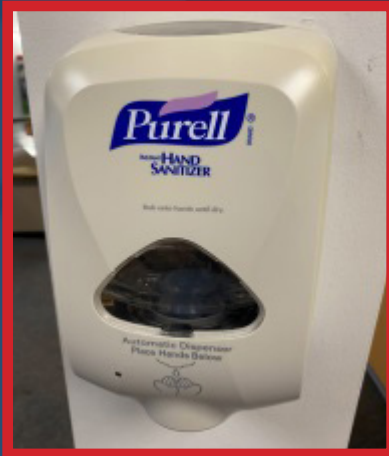
Wall-Mounted Hand Sanitizer Dispenser